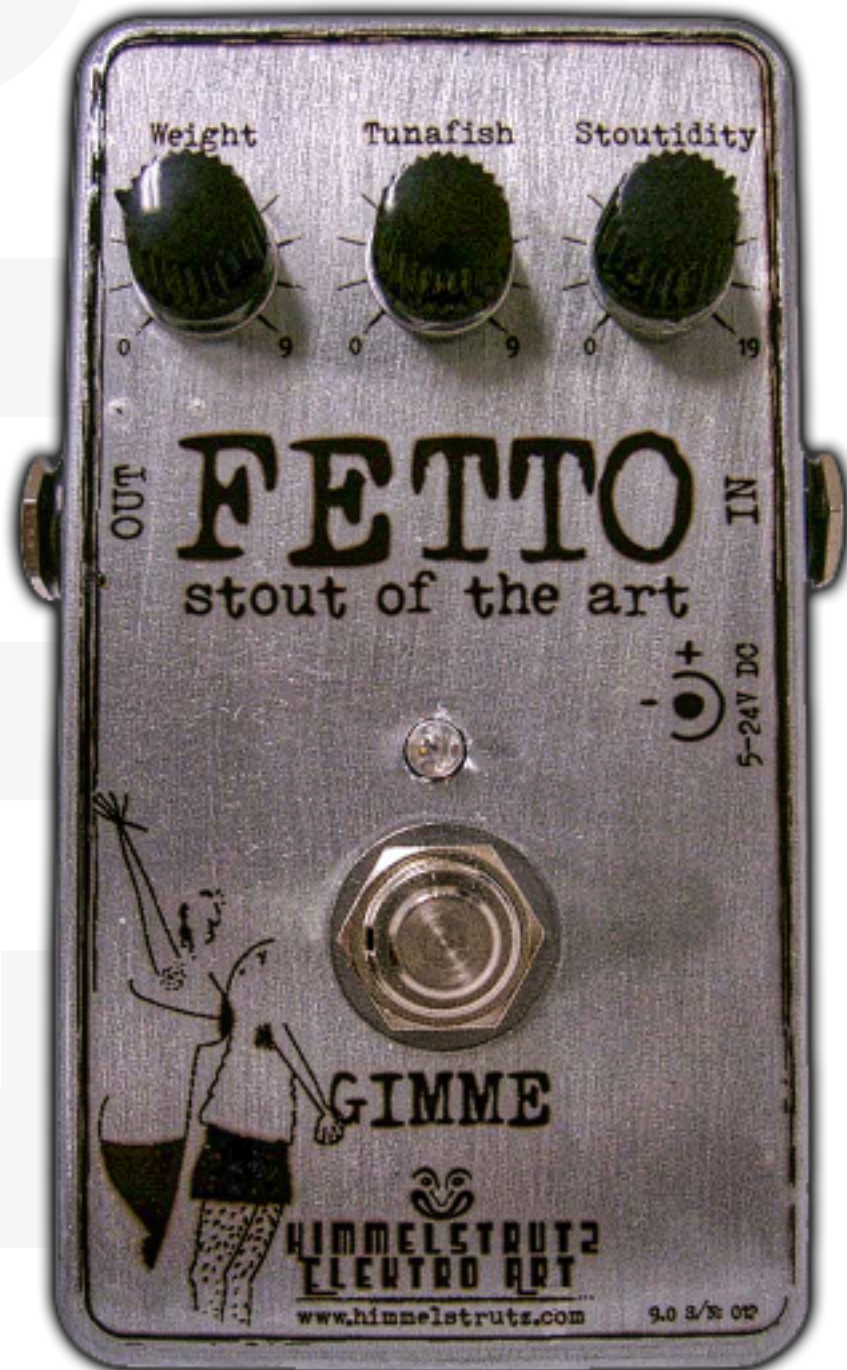
Fetto 9.0 Owner's Manual (1.4)